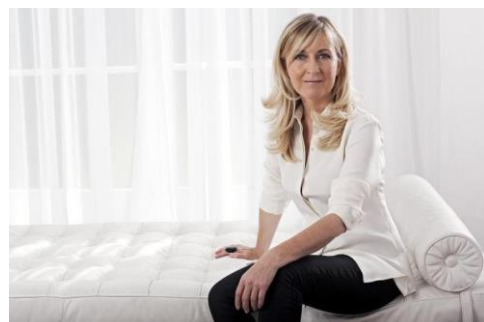
Fiona Phillips (Journalist, Broadcaster and Television Presenter) Conference Keynote Speaker